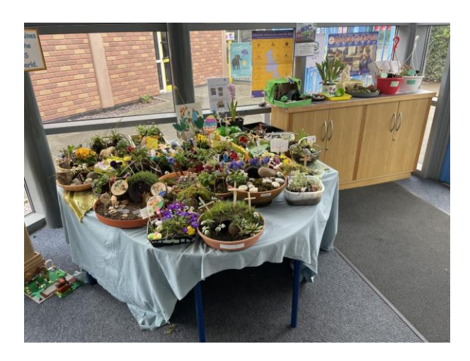
3 - Our Easter Gardens.

The children have used sustainable materials to represent the crucifixion and Resurrection in the form of an Easter garden. They are wonderful and displayed in the school entrance. We have had so many positive comments about them and I hope that you enjoyed supporting your child to make them. Each child received a special treat and two children were chosen as the winners of the competition and received an Easter egg and a book.