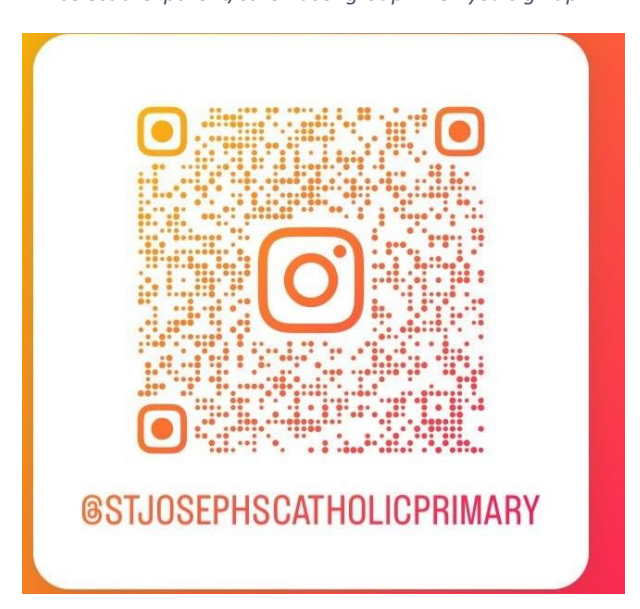
5 - Please scan for our Instagram page.

Within school, we are able to see which courses that you have completed, but not any other details. Please ensure that you select the 'parent/carer' user group when you sign up.